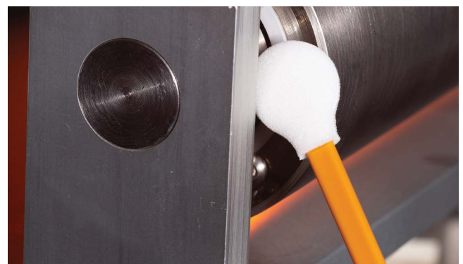
TX805 Foam Swab with Circular Head