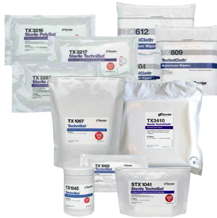
TechniCloth® 45% Polyester / 55% Cellulose